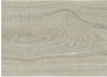
509 Washed Oak