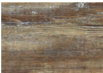
717 Tattered Barnboard