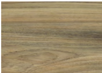
405 Whispering Wood