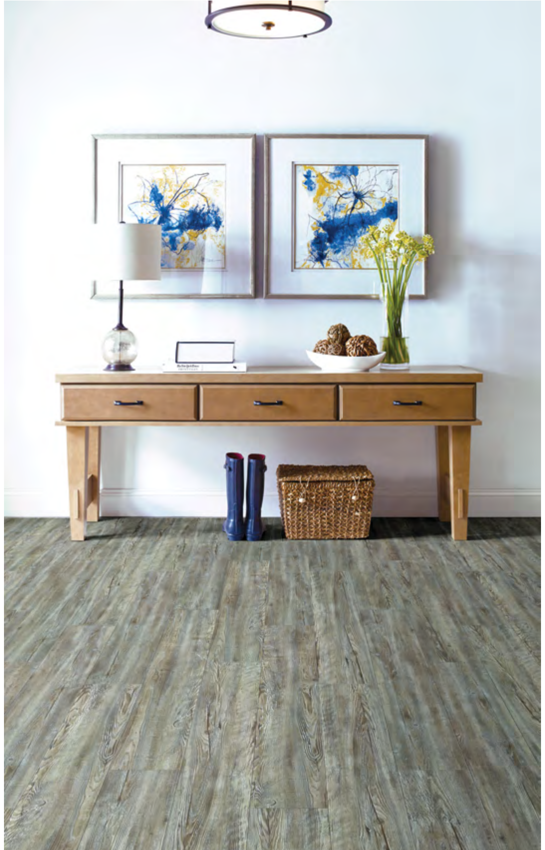
400 Weathered Barnboard