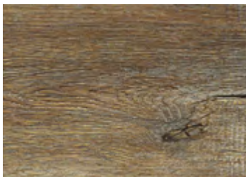
709 Modeled Oak